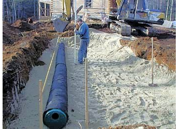
Enviro-Septic® installed in a below-ground seepage bed. Daily Flow Rate is 1,080 litres