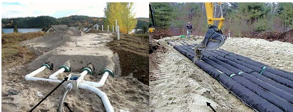
Distribution Box Pump Line from Pre-Tank

Surprisingly, the aerobic air mixture and dilution of the septic tank off gases and the venting system does not create an odour problem.