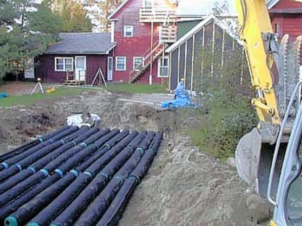
Enviro-Septic® installed in a below-ground seepage bed. Daily Flow Rate is 2,700 litres

Enviro-Septic® is manufactured in 10 foot lengths, but may easily be cut to any length with a sharp knife in order to work around site limitations or obstacles. It can also be bent up to 90 degrees allowing a variety of useful system shapes such as curved, trapezoidal, L, S, or U-shaped. Enviro-Septic®'s flexibility allows for more pleasing landscaping possibilities as pipe sections can be installed to match terrain, even sloping sites, reducing the amount of fill required and eliminating unsightly septic mounds. Pipe sections, couplings and end caps are all available as part of the system's components.